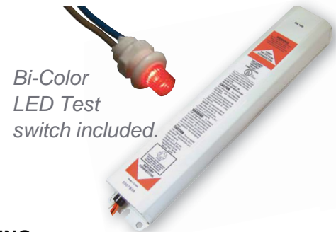
Bi-Color LED Test switch included.